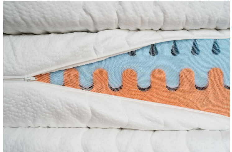
Recycled content and designed for recycling - mattresses from NEVEON based on BASF's recycling technology