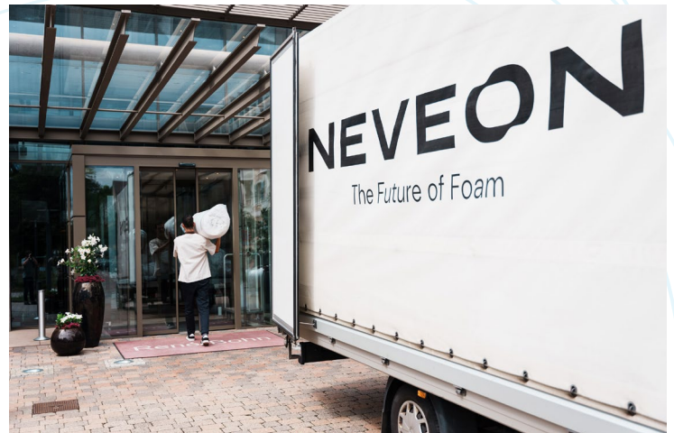
Delivery of mattresses with recycled content from NEVEON to BASF's Hotel René Bohn, Source: BASF SE